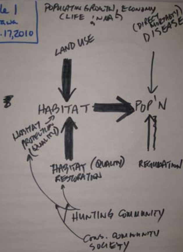
Table 1 Ottawa Feb. 17, 2010