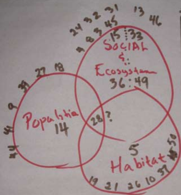
Table 4 Ottawa Feb 16-17 2010