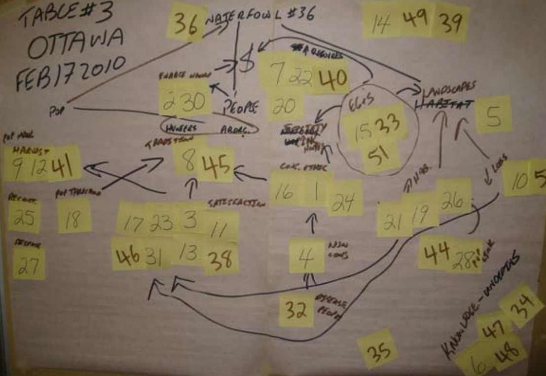
TABLE #3 OTTAWA FEB 17 2010