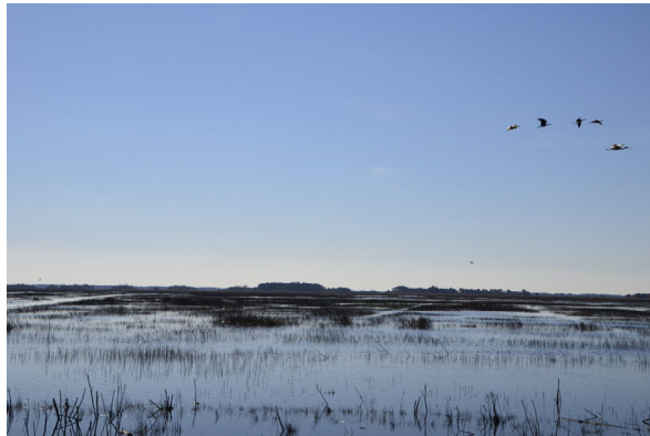
Waterfowl take flight over SCDNR managed wetlands in the Santee River basin.

South Carolina Natural Resources A Blog of the S.C. Department of Natural Resources