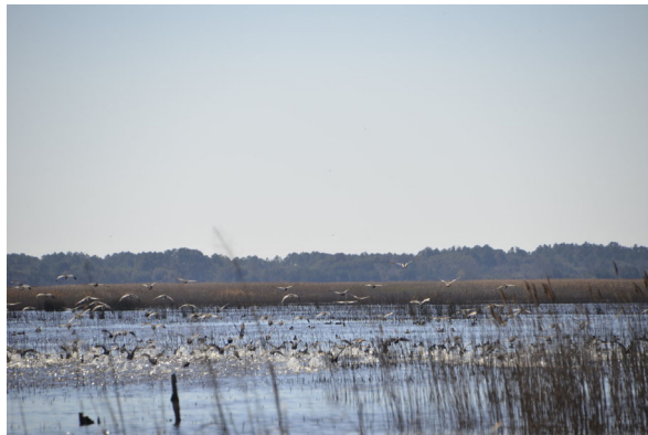
NAWCA grant partnerships have played a critical role in protecting South Carolina's most productive waterfowl habitats.

Here in South Carolina, dozens of NAWCA-funded projects involving the S.C. Department of Natural Resources and other partners have protected and restored hundreds of thousands of acres of wetland habitats to the great benefit of all South Carolinians, both now and in the future. Audubon South Carolina, Ducks Unlimited, The Nature Conservancy, and the U.S. Fish & Wildlife Service have worked with private landowners, regional land trusts, timber companies, foundations, and local governments to protect important landscapes in the Ace Basin (also celebrating its 30th anniversary this month), Winyah Bay, and Savannah River regions of South Carolina. In the ACE Basin alone, NAWCA grant projects have protected more than 200,000 acres, according to the Atlantic Coast Joint Venture organization ( https://acjv.org/funding/the-north-american-wetlands-conservation-act/ ).