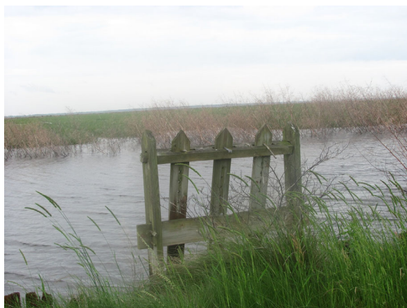
NAWCA has had tremendous benefit in terms of protecting critical waterfowl habitats in the Lowcountry of S.C.

Learn (/home/category/learn/) Hunt (/home/category/hunt/)