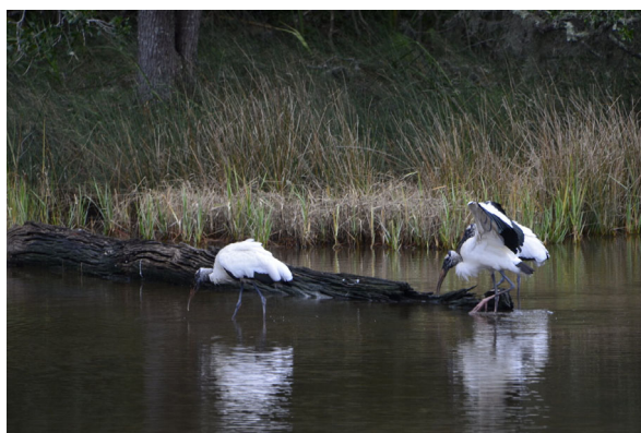
Wood storks forage in a wetland area in Beaufort County.

In December of 2019 and into 2020, the thirtieth anniversary of "NAWCA" (The North American Wetlands Conservation Act) will be celebrated. If you are a waterfowl hunter or involved with the organization Ducks Unlimited, then you are probably at least somewhat familiar with NAWCA, but the millions of acres of wetlands that have been protected under the Act have also benefited many non-game species, and every single American citizen has a stake in the protection of wetlands.