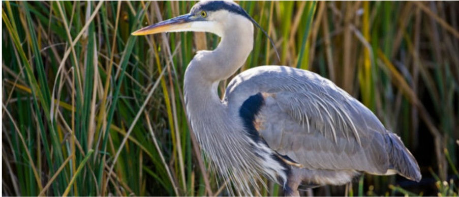
The House has passed legislation to extend the North American Wetlands Conservation Act.

Recent passage of the U.S. House of Representatives passed the North American Wetlands Conservation Extension Act ( H.R. 925 ) would reauthorize and increase funding for the North American Wetlands Conservation Act , which benefits migratory birds and other wildlife.